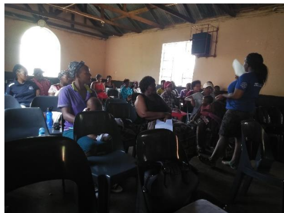
Images: Community meeting at Phuzumoya NCP (Lubombo) and Bethany (Manzini)

Myths and misconception regarding disabilities were corrected. The participants were provided with Facts regarding disability and were encouraged to use the right terminology that does not discriminate children or people with disabilities. The community members were very happy