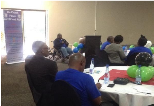
Image: Speaker from FODSWA